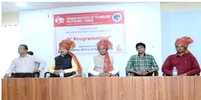
Dignitaries on the dais during the inauguration of the programme.