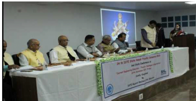
Dignitaries on the dais during the inauguration of State Annual Faculty Convention of ISTE Gujarat Section