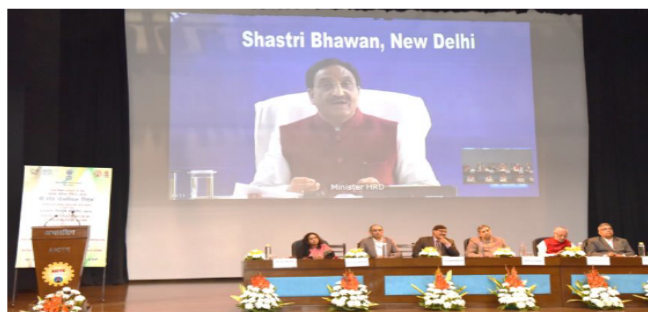
Shri Ramesh Pokhriyal "Nishank", Hon'ble Union Minister of HRD addressing the gathering via Video conferencing on 3-12-2019 at AICTE Auditorium.

4. Jal Shakthi Abhiyan - Jal Shakthi Abhiyan is aimed to accelerate water harvesting, water conservation and bore well recharge activities in 256 water-stressed districts. Most of the participation is from the state of Tamil Nadu which is most hit due to present water crises.