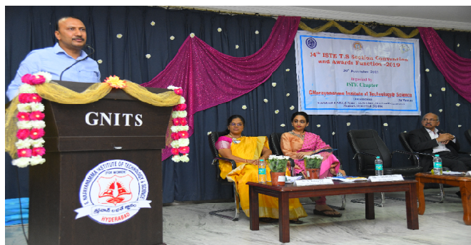
Chief Guest Sri Navin Mittal IAS addressing the delegates during the inaugural function.