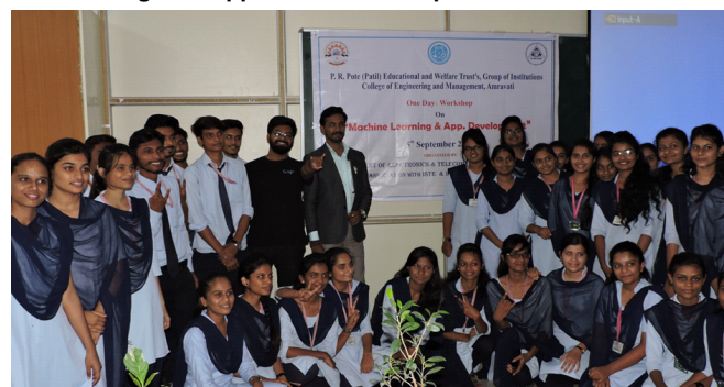
Group photo of the programme.