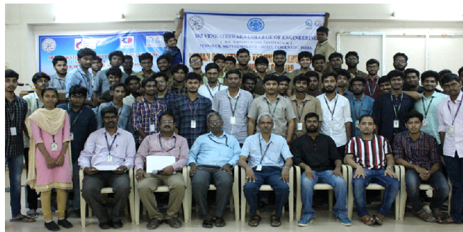
Participants, faculty & students during the workshop.

Only sharp and well focussed photographs with ISTE Logo and Banner in the background shall be considered for publication.