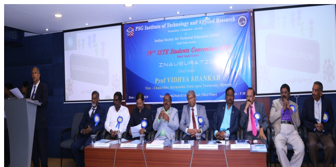
Dignitaries on the dais during the inauguration of the Students Convention