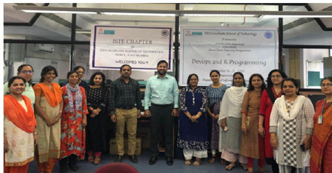
Faculty and participants during the programme.