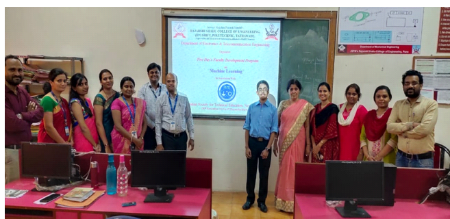
Dignitaries and participants during the programme.