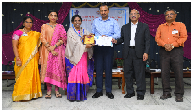
Best Engineering College Teacher award during the Award function.