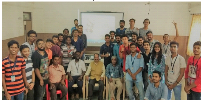
Dignitaries and participants during the Debate Competition.