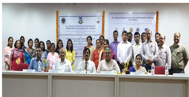
Dignitaries with participants during the inauguration of programme.