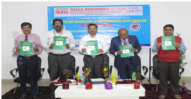
Release of programme proceedings by the dignitaries on dais.