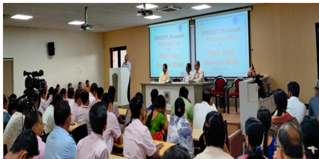
Hon.Principal, HoDs, Faculty, Parents & students during parents meeting.