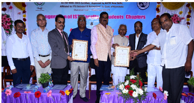
Dignitaries on the dias during the inauguration of Chapters.