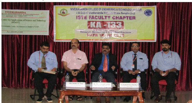
Dignitaries on the dais during the inauguration of workshop.

Only sharp and well focussed photographs with ISTE Logo and Banner in the background shall be considered for publication.