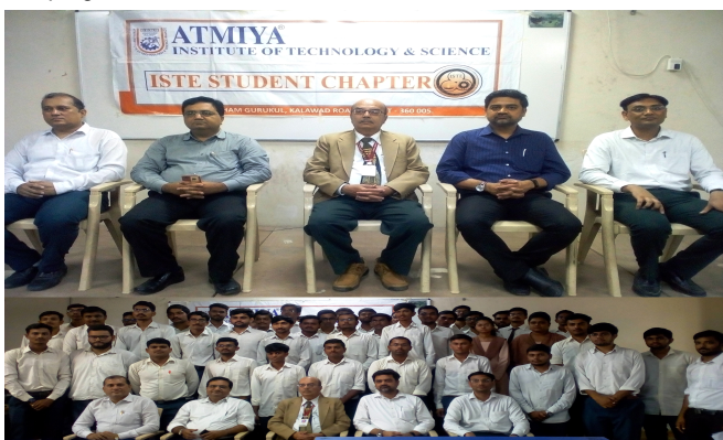
Participants and Experts during the workshop.