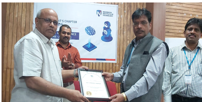
Inauguration of ISTE Students Chapter by the Chief Guest.

.....Flag Hoisting and Tree plantation contd. from page no.1