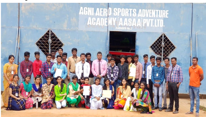
Students during the Industrial Visit.