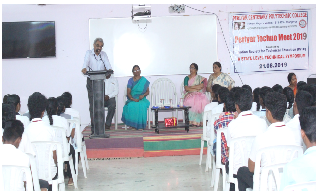
Dignitaries during the inauguration of the programme.