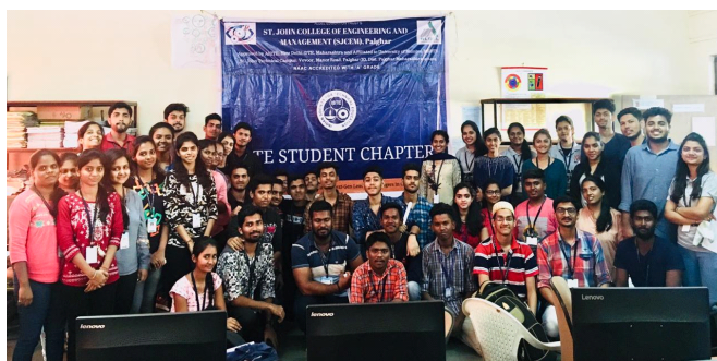
Student participants during the event.