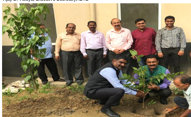
Tree plantation at ISTE Hqrs. on 15-8-2019