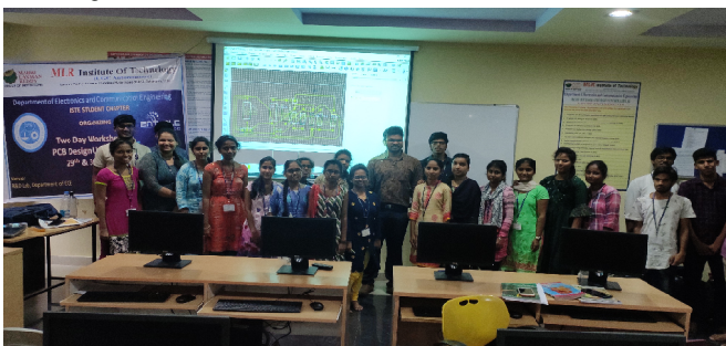
Student participants during the workshop.