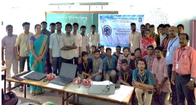
Students and faculty members during the workshop.