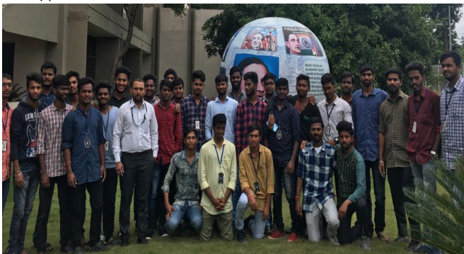
Students during the Industrial Visit.