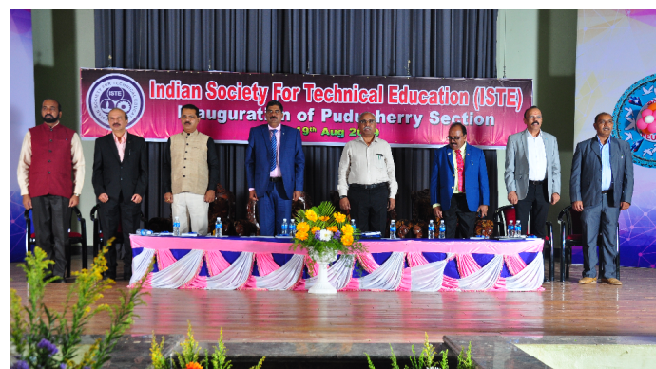
Dignitaries on the dais during the inauguration of ISTE Pondicherry Section on 19-8-2019.