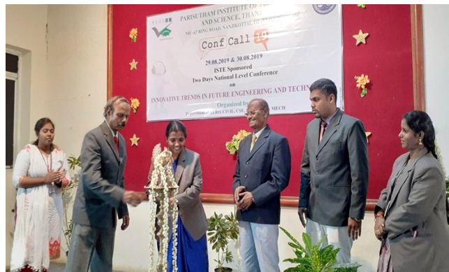
Inauguration of National Level Conference.