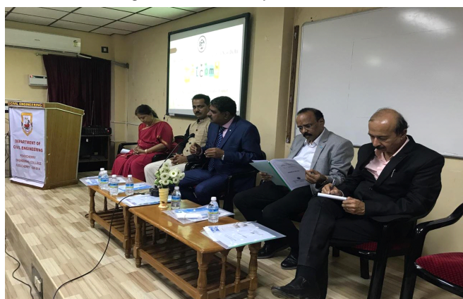
ISTE Office Bearers during the 113th ISTE National Executive Council Meeting on 19-8-2019.